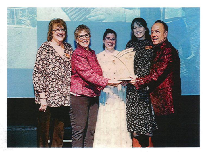
Arthurdale Heritage was named as a 2024 Governor's Arts Award for Folk Arts Organization

To support arts and heritage programming in Preston County, AHI respectfully requests $10,000 from the Preston County Commission.